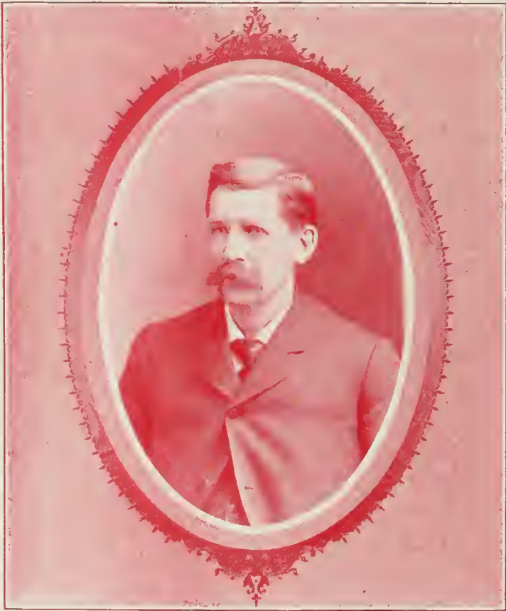
HON. R. B. WARD, State Senator 32d District.